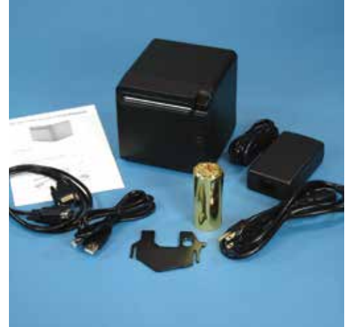
Contains Everything Necessary in the Carton – Including the Serial and USB Communication Cables