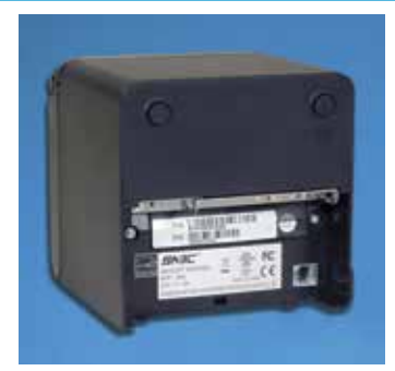
Drop and Print Paper Loading With Standard Paper Width Selector